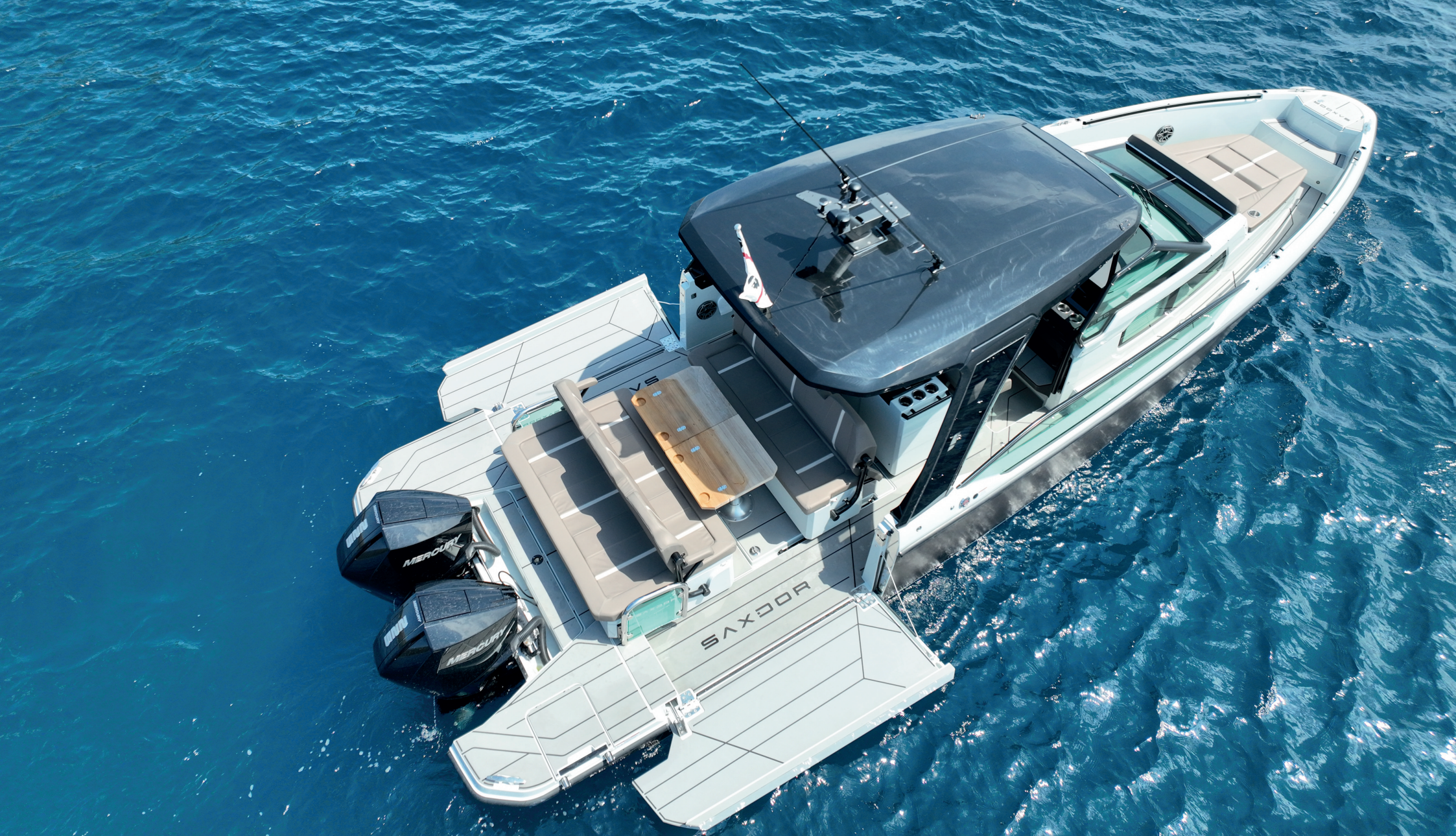
SAXDOR 320 GTO